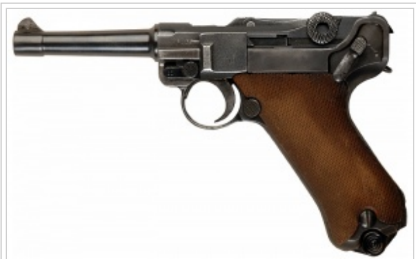
Luger P08 - 9x19mm.