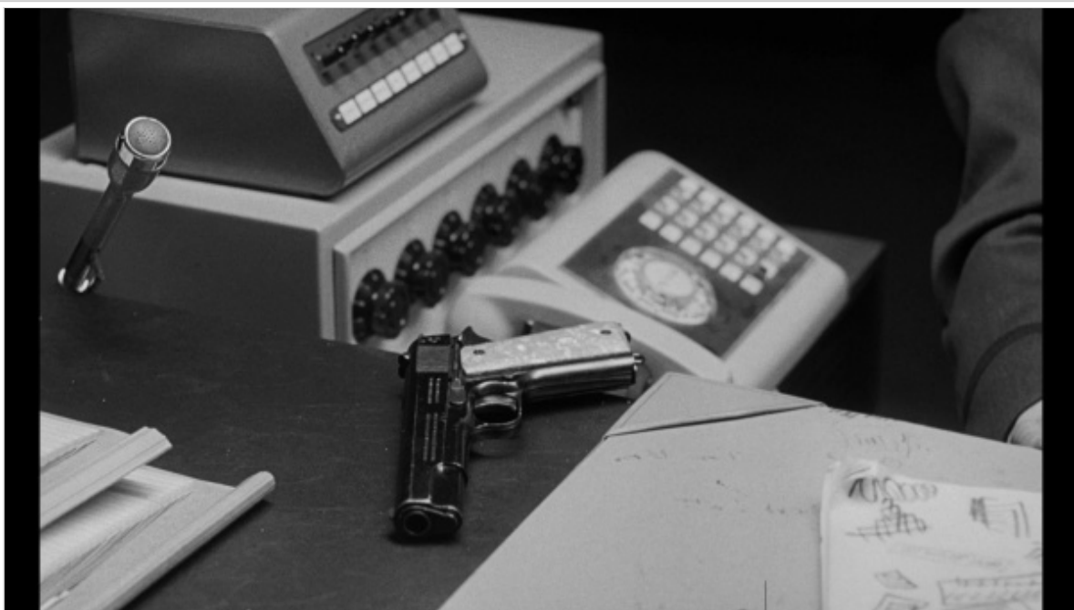
The M1911 used by General Ripper.

The M1911 is taken out of the Survival Kit issued to the B-52 crew as Major Kong reads off the contents, including several comical-sounding but accurate items like nylon stockings and lipstick which were intended for trading with locals if the crew had to bail out over enemy territory. Of note is at the end of the sequence Kong says "shoot, a fella could have a good weekend in Vegas with all that stuff," but his mouth sounds out "Dallas." The line was dubbed over after the Kennedy assassination occurred during production.