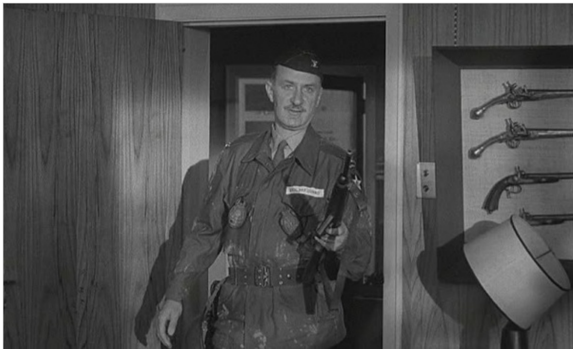
An M1 Carbine is carried by Colonel Bat Guano (Keenan Wynn) when he confronts Group Captain Lionel Mandrake (Peter Sellers).