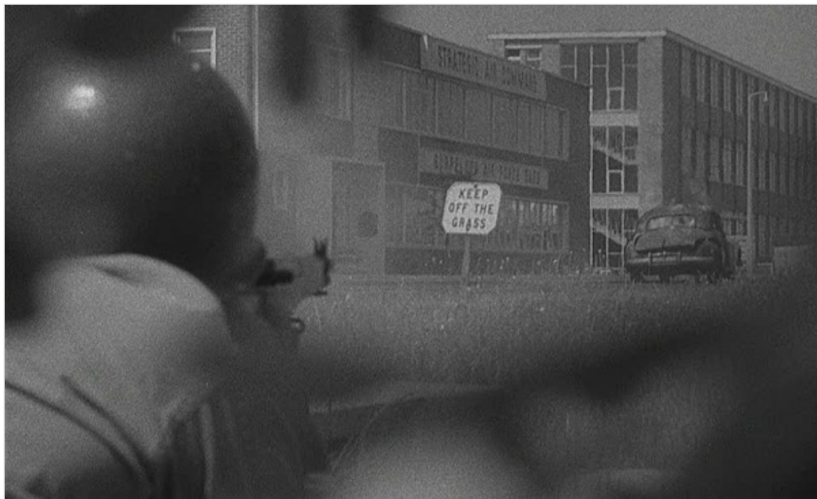
A US soldier fires on the SAC headquarters with his M1 Garand.