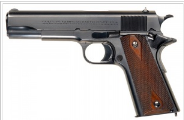
Original Colt M1911 - .45 ACP

An older M1911 pistol is among the contents found in the survival kit of the B-52 bomber crew, which includes USAF Major Kong (Slim Pickens) and USAF Lieutenant Lothar Zogg (James Earl Jones). Also an M1911 with pearl grips is used by Gen. Ripper to threaten Group Captain Lionel Mandrake (Peter Sellers).