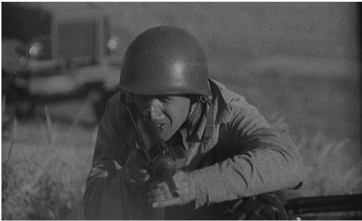
The M3A1 "Grease Gun" is used by US forces defending the airbase.