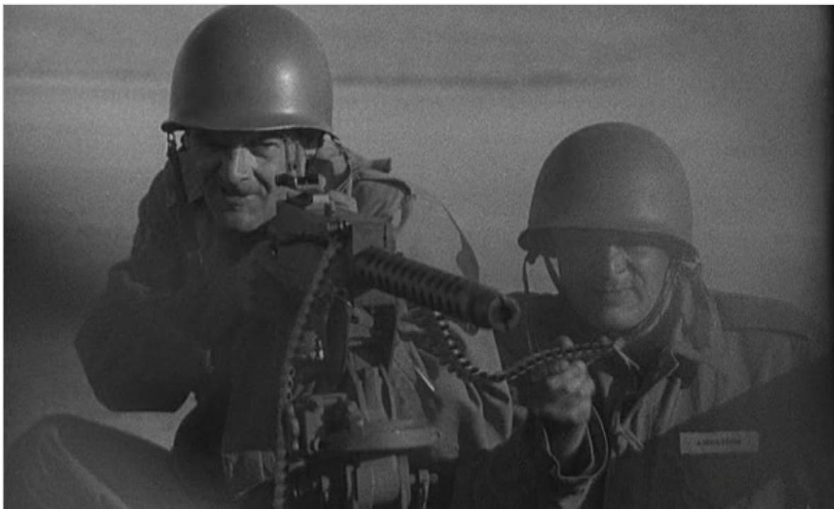
General Ripper's troops open fire with the Browning M1919A4.