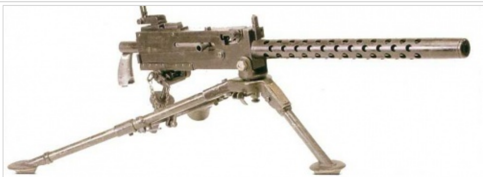
M1919A4 Machine Gun - .30-06

A Browning M1919A4 machine gun is notoriously seen wielded by USAF Gen. Jack D. Ripper (Sterling Hayden). The weapon was carried in his golf bag and he uses it handheld to repel the Army forces sent to retake the air base. US Army troops that assault the airbase use the M1919 but with a tripod.