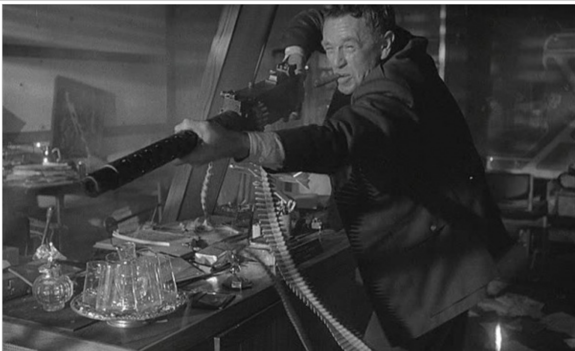
General Ripper uses the M1919A4 to protect his bodily fluids from the commies. Note that in real life, holding the weapon in that way, with one hand unprotected on the barrel, would cause severe burns.