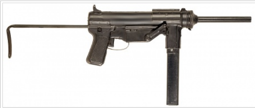
M3 Grease Gun - .45 ACP