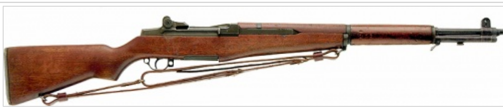
M1 Garand semiautomatic Rifle with leather M1917 sling - .30-06