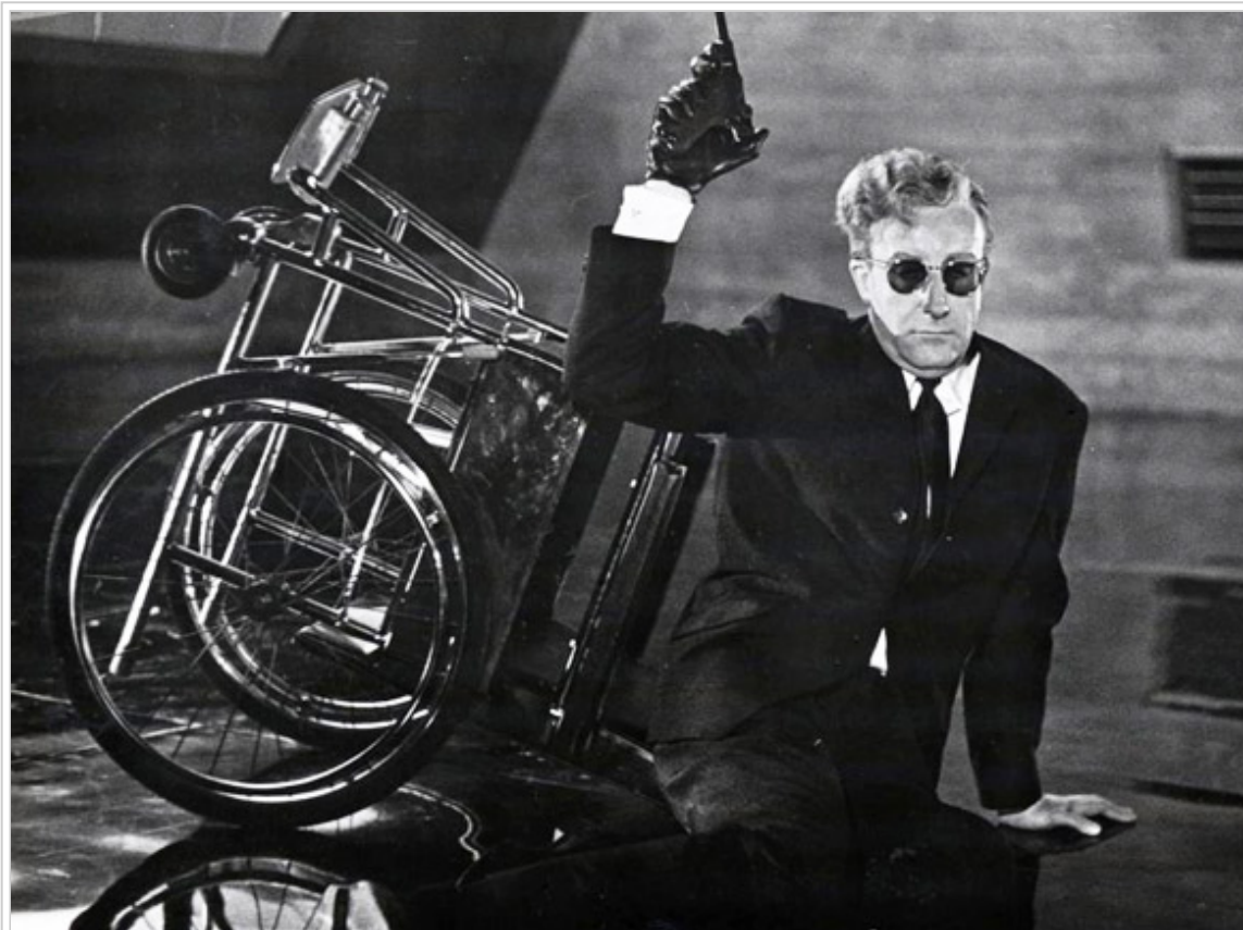
Dr. Strangelove draws his Luger.