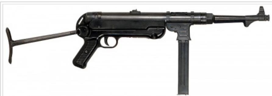
MP40 - 9x19mm

Oddly, some of the US Army soldiers attacking Ripper's Air Force base can be seen carrying and firing German MP40s.