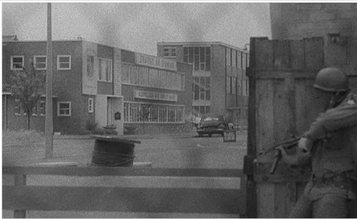
A soldier wielding an MP40 fires at General Ripper's base. The weapon was likely used due to its resemblance to the M3 Grease Gun.