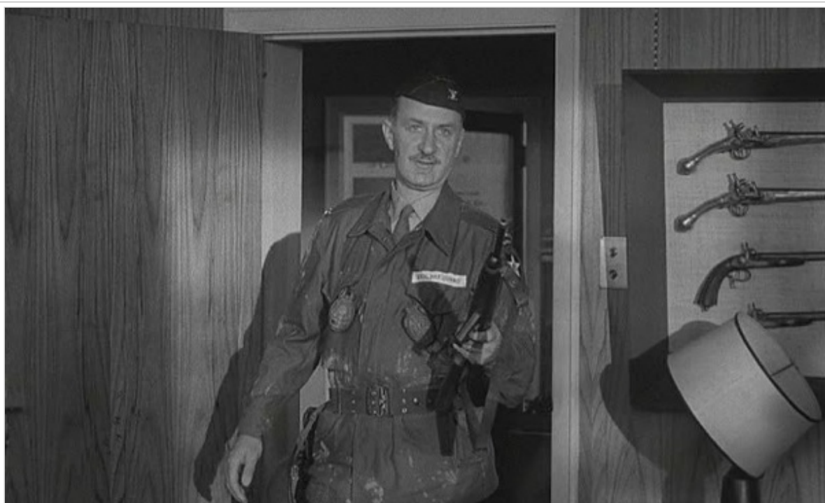
The bottom two pistols appear to be Howdah Pistols.

Retrieved from " http://www.imfdb.org/index.php?title=Dr._Strangelove_or:_How_I_Learned_to_Stop_Worrying_and_Love_the_Bomb&oldid=1232869 " Categories: Movie | Comedy | War | B&W | Stanley Kubrick | National Film Registry