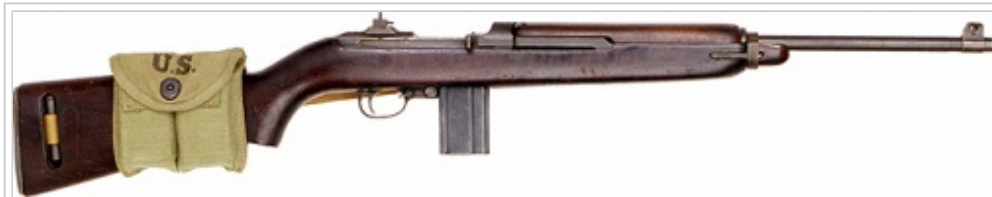
World War Two Era M1 Carbine, with Dark Walnut Stock, 'L' peep sight and no bayonet lug - correct for most of WWII, shown with khaki sling and oiler and a period Magazine pouch for buttstock

An M1 Carbine is carried by Colonel Bat Guano (Keenan Wynn) when he confronts Group Captain Lionel Mandrake (Peter Sellers).