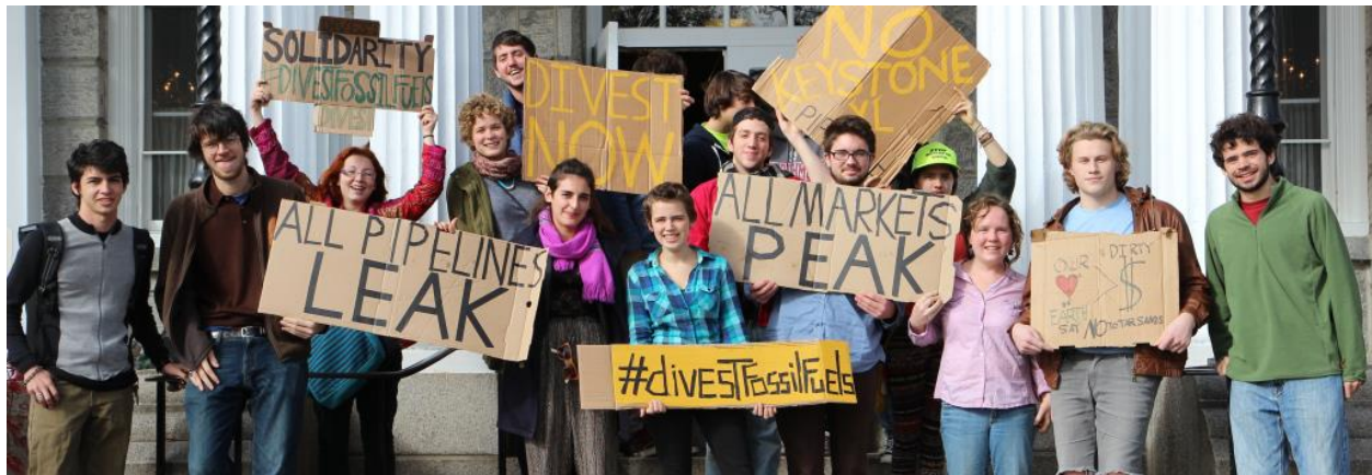
Members of Swarthmore Mountain Justice, where the contemporary fossil fuel divestment campaign emerged.

pricing initiatives, and campaigns against mountaintop removal coal mining (MTR), Arctic drilling, and hydraulic fracturing (fracking) (Aronoff & Maxmin, 2014). Beyond environmental justice, many divestment groups have organized in collaboration with the Black Lives Matter movement, and are working on the intersection of racial and climate justice (Divest Harvard, 2014). Other groups, such as Divest Columbia for a Fossil Free Future, have worked with campus prison divestment campaigns. 12 Furthermore, fossil fuel divestment campaigns have created space for network building among campuses themselves as evidenced by the Divestment Student Network.