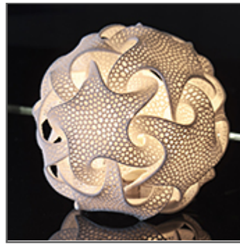
Lamps Designer lighting, in collaboration with MGX by Materialise.