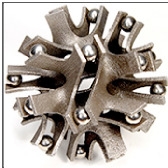
Metal Printing Archive Designs retired from stock.