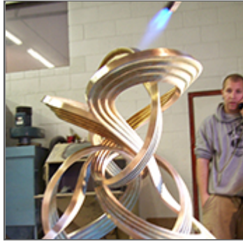
Commissions Larger works.