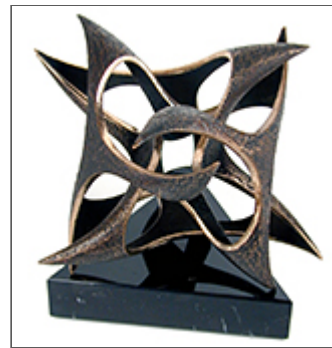
Bronze Geometry How I worked before metal printing.