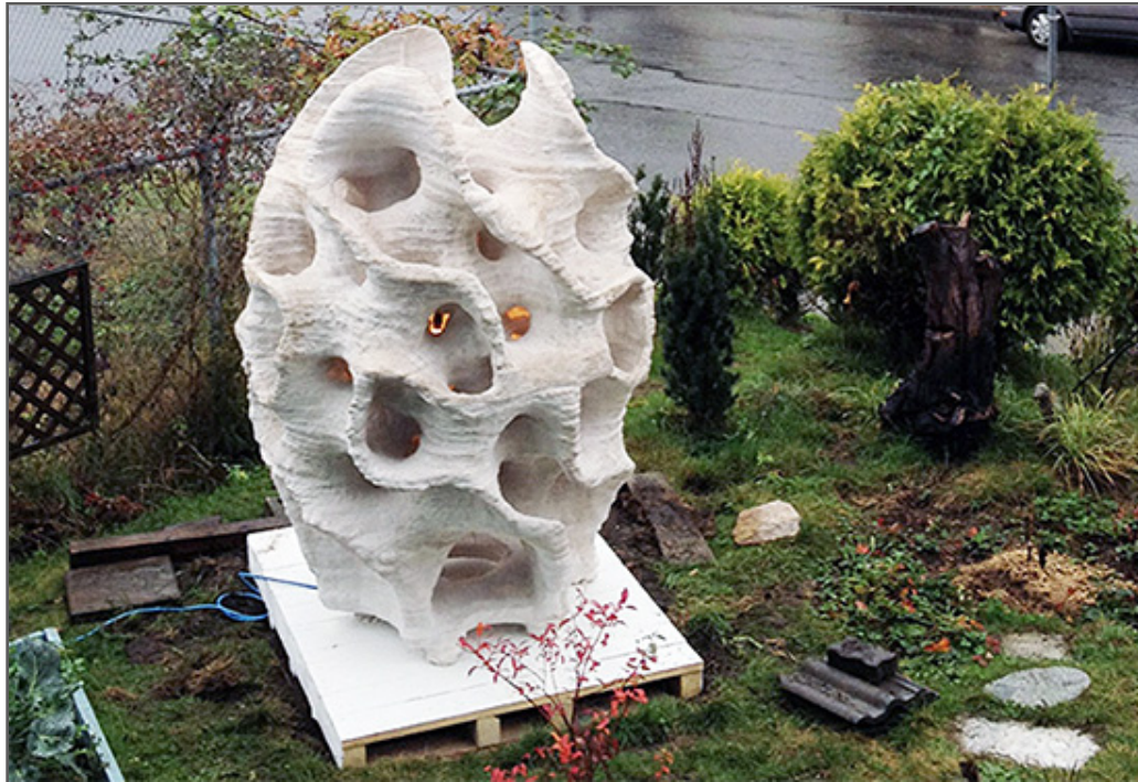
Rygo , a large stonelike sculpture printed by D-Shape .

Things outside my regular line of business.