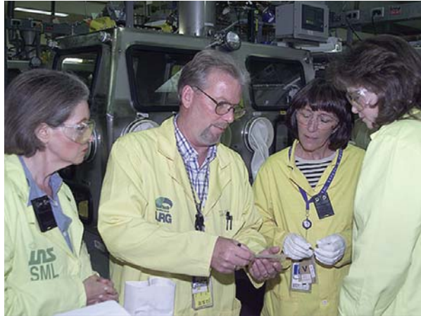
Figure 4. Quality Assurance Audit Los Alamos and National Nuclear Security Administration quality specialists verify that quality assurance systems support pit manufacturing.

The next major milestone was the delivery of a certifiable pit—a pit that