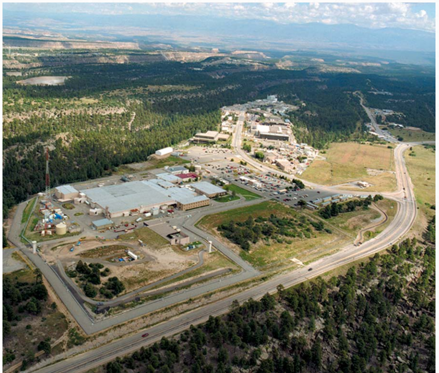
Figure 1. The Rocky Flats Plant and TA-55

These pictures are aerial views of the Rocky Flats Plant (top) and TA-55 at Los Alamos (bottom).